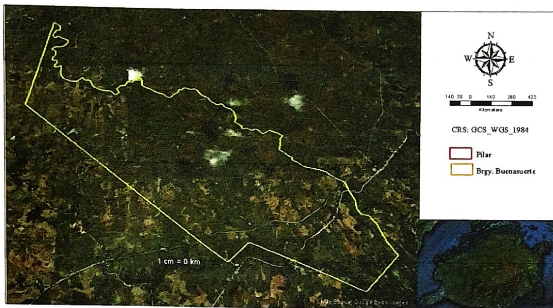
Figure 1. Location map of the study site