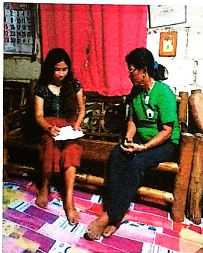
Figure 2. The researcher conducting the survey interview

questionnaires. The survey questionnaires were distributed through home visitation in response to the social distancing protocol. However, the proper observance of social distancing and health precautionary measures is necessary. Pilot testing is to be conducted first to test whether the tool needs revision or not in gathering the data. The researcher will explain the mechanics of the study to ensure. After retrieving the questionnaire, the data were consolidated and interpreted. Figure 2. The researcher explained the mechanics of the study to ensure credible survey result.